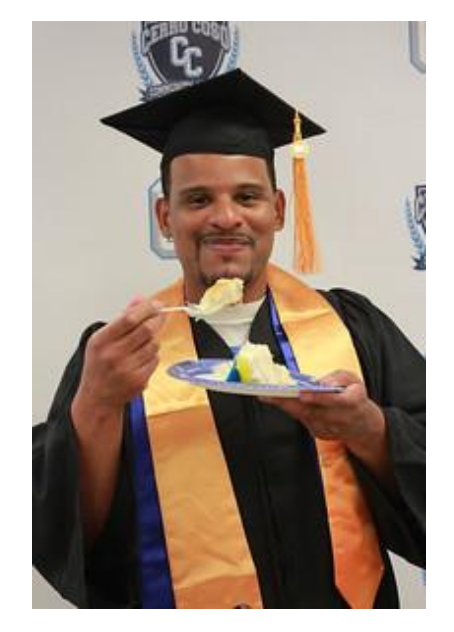
Cal City Prison